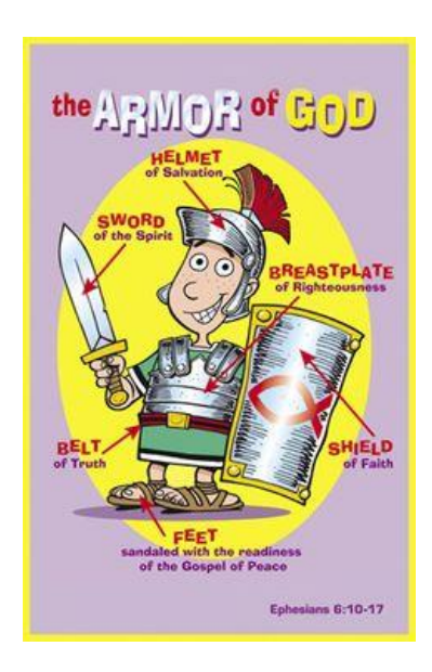
Depiction of spiritual armour. (No armour for the back - no running away.)

Some people don't take Satan seriously enough; others take him too seriously and spend time seeking him out, looking for a fight. We are given spiritual armour (all are different perspectives of the Gospel) to fight and win in the spiritual realm. Slip it on and stand firm. We are called to stand, to be strong in the Lord, with confidence. Don't forget the key element of prayer (v. 18), which is often overlooked.