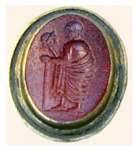
A seal from New Testament times